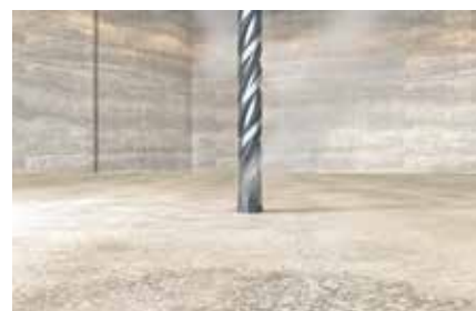
Drilling in floor plate