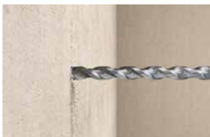
Drilling in concrete wall